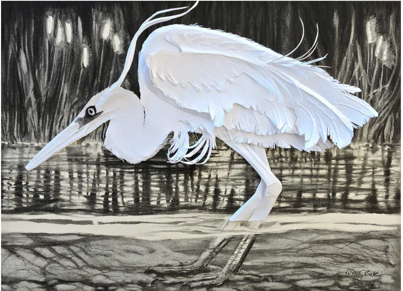
HERON INSPIRATION: KOSHKONONG CREEK, CAMBRIDGE, WI