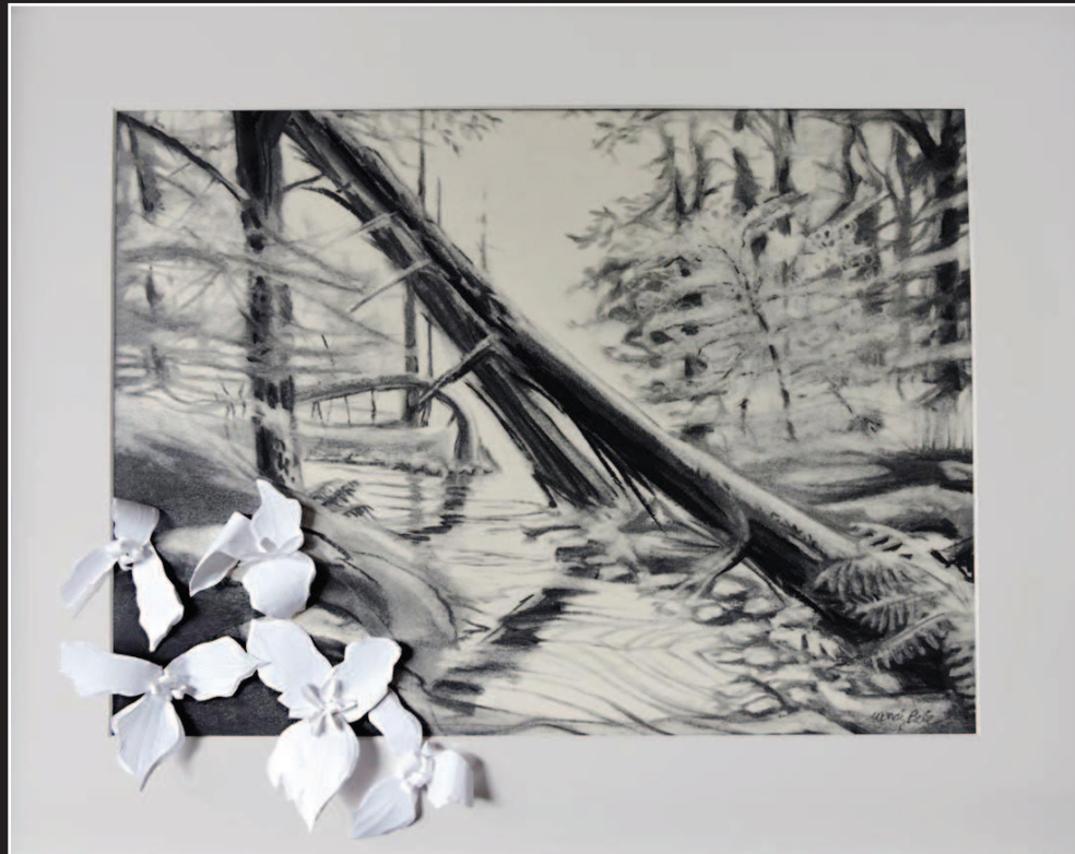
TRILLIUM INSPIRATION: HATCH RUN, GLADE TOWNSHIP, PA