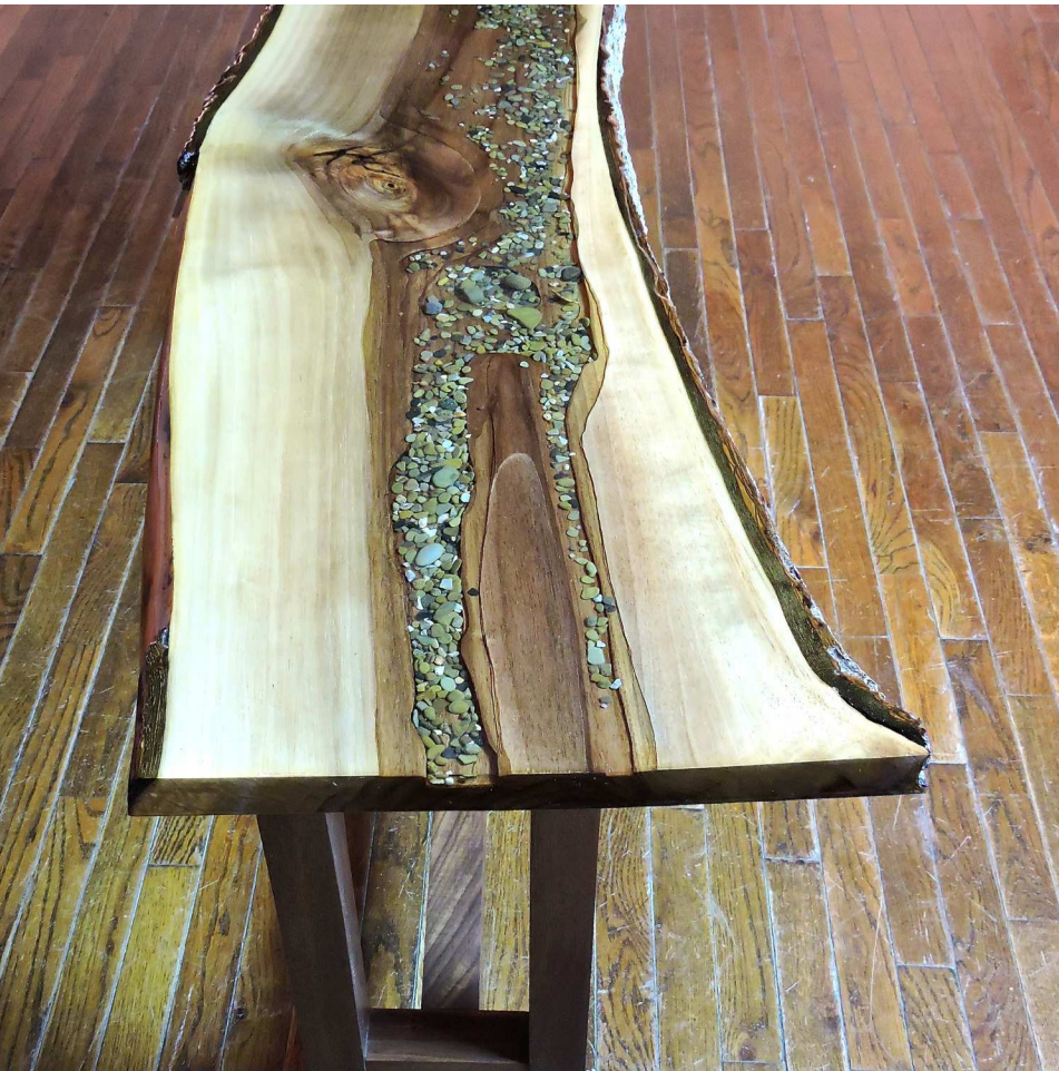
KENNY & DOLLY INSPIRATION: THE SONG "ISLANDS IN THE STREAM"