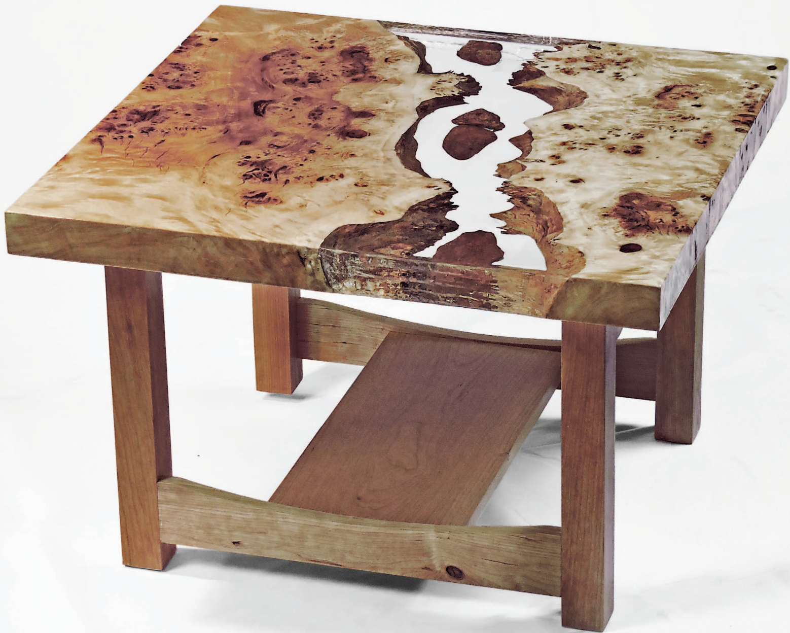
OAK CREEK CANYON INSPIRATION: HIKING THE OAK CREEK CANYON TRAIL