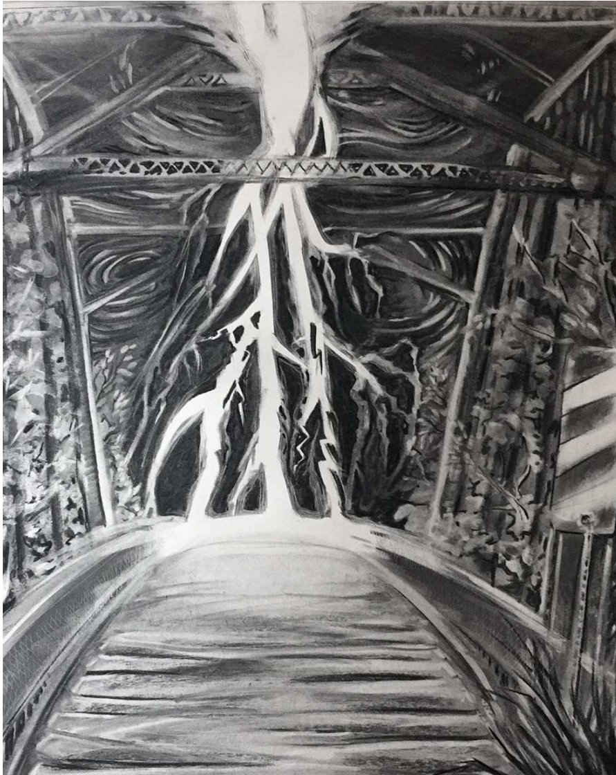
THUNDER BRIDGE INSPIRATION: LITTLE SIOUX RIVER, SPENCER, IA