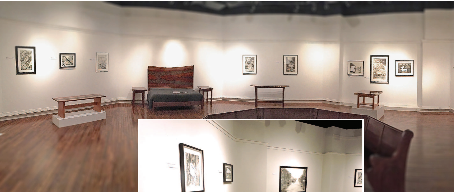
PATTERSON LIBRARY OCTAGON GALLERY WESTFIELD, NY